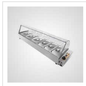
Table Top Bain Marie