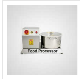
Electric Potato Fryer