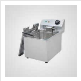
Electric Potato Fryer