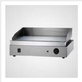
Electric Gas Griddle