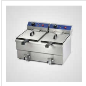
Gas Potato Fryer