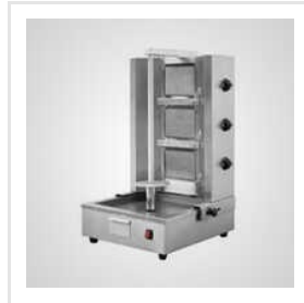
Gas Shawarma Machine