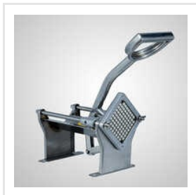
French Fry Cutter