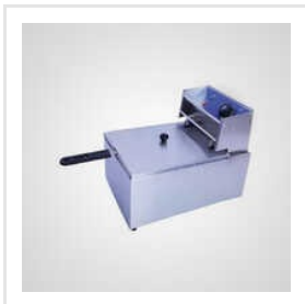
10L Electric Potato Fryer