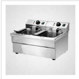
Electric Potato Fryer