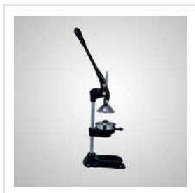
French Fry Cutter